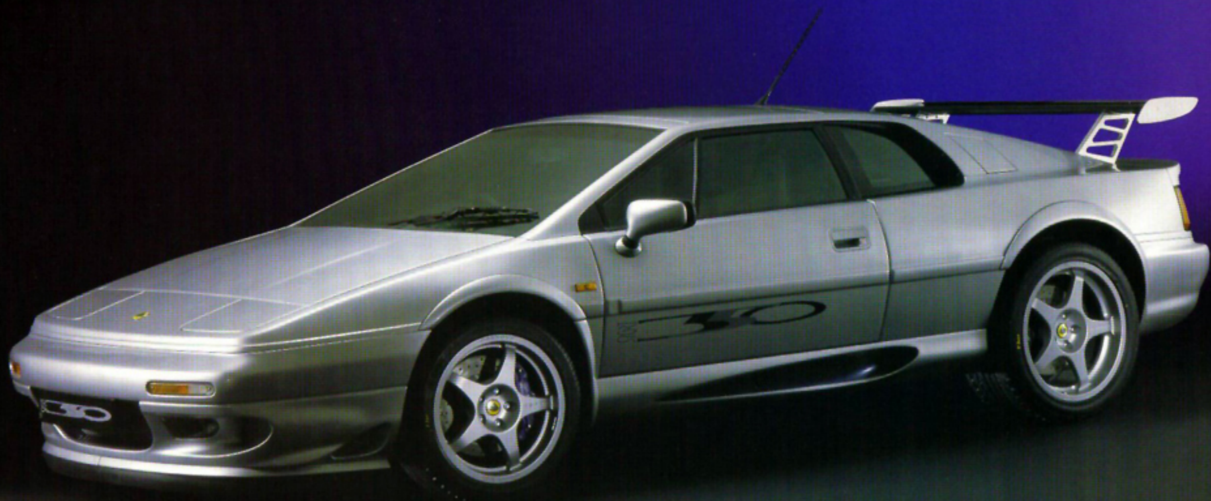
Lotus Esprit V8 Sport 350